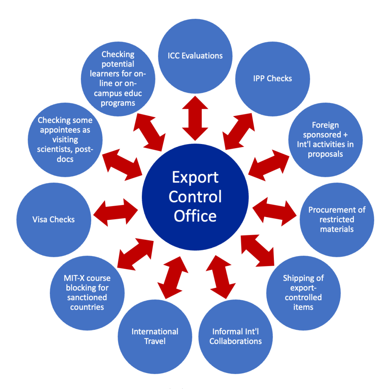
Figure text: International People Placement (IPP) checks

International Coordinating Committee (ICC) evaluations Foreign-sponsored or international activities in proposals